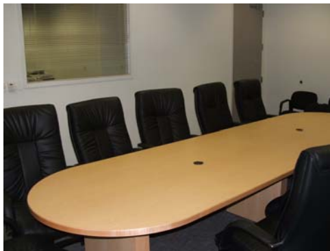
▶ Customer: DotHill Systems