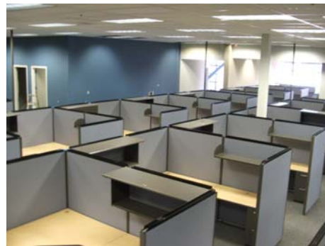
▶ Location: Carlsbad, CA