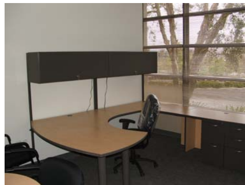
▶ Location: Carlsbad, CA