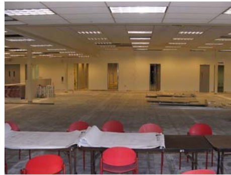
▶ Location: Carlsbad, CA