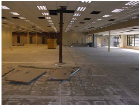
▶ Customer: DotHill Systems